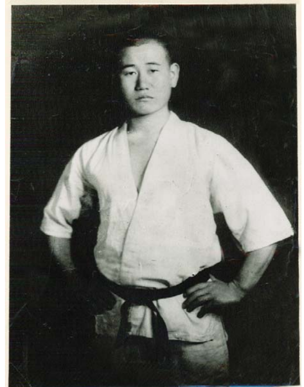
FATHER OF KOREA TAEKWONDO.